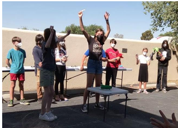
Green Eggs and Ham, in sign language

More enrichment: Lou Ellen ran two Scholastic book fairs at the school; students got a lot of good reading as they and their parents purchases many books.