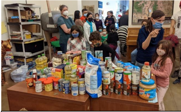
The food drive at the Community Meeting